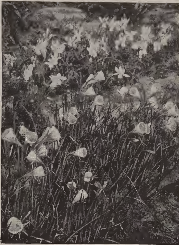
Bulbocodium conspicuus and Triandrus albus